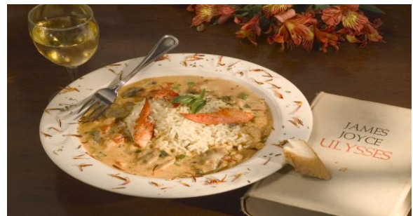
The Dublin Lawyer

A Great Value If you're looking for a special dining experience for your group before or after an event, concert or tour, choose Nighttown and you'll get much more than just fabulous food. We give you the best package in town with inclusive pricing.