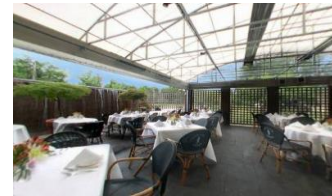
Stephen's Green (outdoor dining & bar)