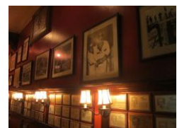
Journalism Hall of Fame

A Great Value If you're looking for a special dining experience for your group before or after an event, concert or tour, choose Nighttown and you'll get much more than just fabulous food. We give you the best package in town with inclusive pricing.