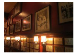
Journalism Hall of Fame