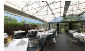
Stephen's Green (outdoor dining & bar)

Nearby Attractions We are 2 minutes from Severance Hall and The Cleveland Museum of Art and just 12 minutes from downtown Cleveland. We're used to partnering with local entertainment venues to get you in and out in a timely manner at a price you can afford.